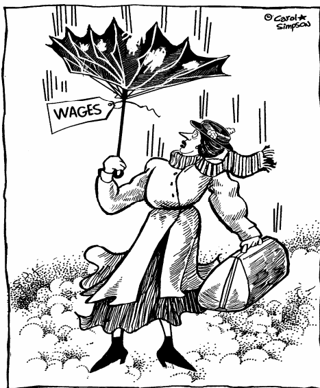
Child care worker

One of the mandates in the By-laws of the CSDC is to "improve the working conditions of Union members in the Community Services divisions". We know that years of funding freezes and cuts to community based services coupled with societal problems such as poverty (including child poverty), less overall job security and lack of affordable housing or childcare, has created conditions in our work environments that places our workers at increased risk of experiencing harm within the workplace; psychological and physical. It is as well noted that workers in community based services are predominantly women.